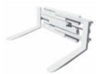
Clamp shown without slip-on pads

Specifications shown above are calculated without slip-on pads Hydraulic Requirements: Double function auxiliary kit